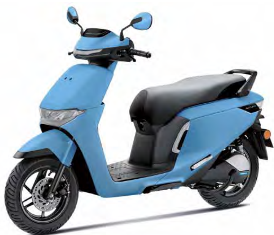
Pearl Serenity Blue